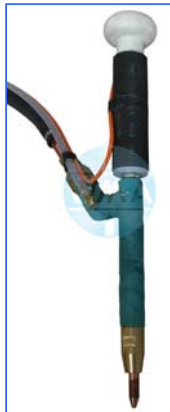
Gun welding head PP8 Order-number: XR1.401.25B000