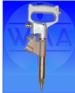
Gun welding head PP5 Order-number: XR1.401.003