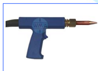
Gun welding head PP1/K Order-number: XR1.401.035B000