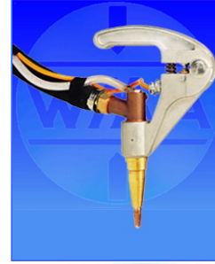
Gun welding head PP6 Order-number: XR1.401.008