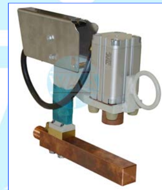
different pneumatic ground clamp Order-number: XR1.401.026B000