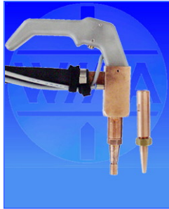
Gun welding head PP1 water or air cooled Order-number: XR1.401.000